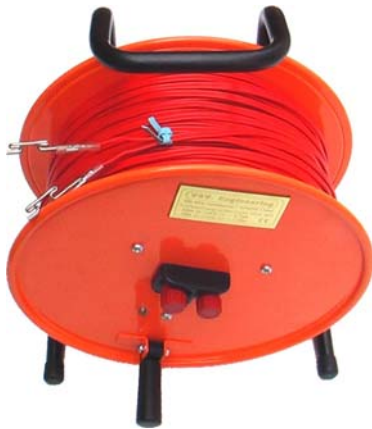
Cable drum standard (double firing line) assembled with 200 m double firing line Cu STC6 2 x (4 x 0,6 mm Ø) – Ref. 1064-000000

The cable drum standard (for double firing line) is a sturdy construction of sheet steel with orange polyester resin coating.