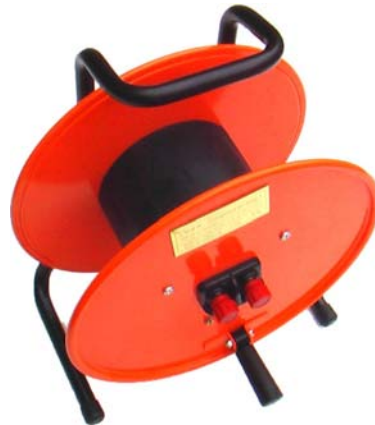
empty – Ref. 1064-000001